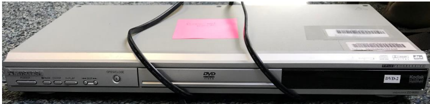
Mitsubishi DD-6050 DVD Player – Qty: 1