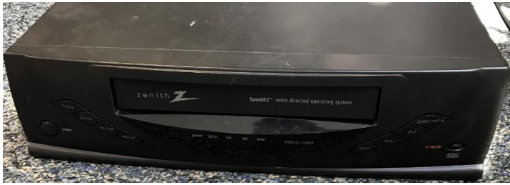
Zenith 3850R-Z070D VCR – Qty: 2