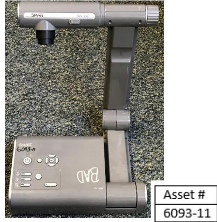
Smart SDC-330 Emo – Qty: 1