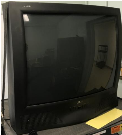
Zenith B27A11Z Television – Qty: 1