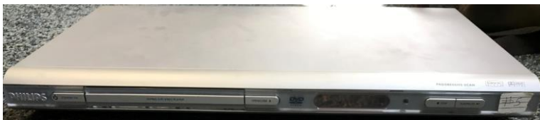
Phillips DVP642/37 – Qty: 2