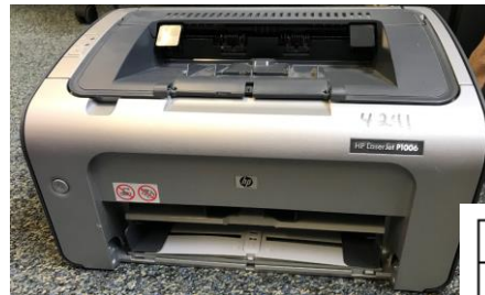
HP LaserJet P1006 – Qty: 1