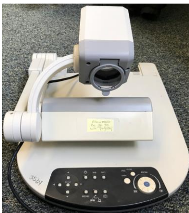
ELMO P10 – Qty: 2