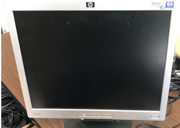
HP L1706 - 17" LCD Monitor – Qty: 22