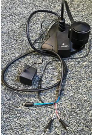
VideoLabs FlexCam Analog Table Camera – Qty: 1