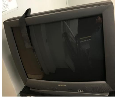
Sharp 32N-S400 Television