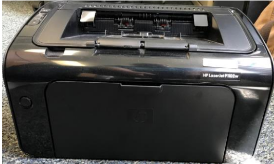
HP LaserJet P1102w – Qty: 2