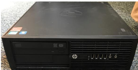
HP Compaq Pro 4300 SFF – Qty: 3