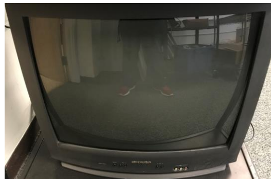
Sharp 27L-S300 Television – Qty: 1

Devices are not guaranteed to function. Operating systems, office programs and other applications are not included. Accessories such as power cords, av cords, adapters, mice, keyboards, etc. not included. Herscher CUSD #2 reserves the right to deny any and all bids.