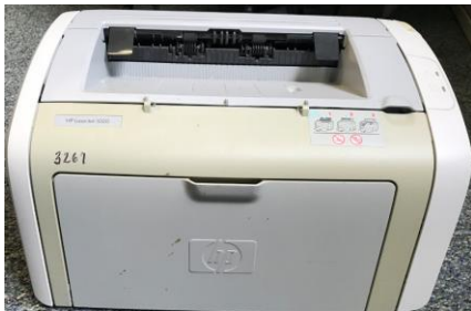
HP Laserjet 1020 – Qty: 1