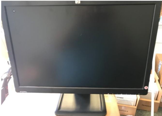
HP LE2201w - 22" LCD Monitor – Qty: 29