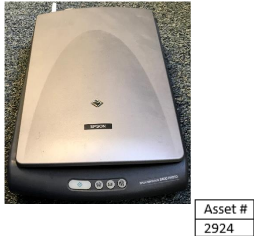
Epson Perfection 2400 Photo Flatbed Scanner – Qty: 1