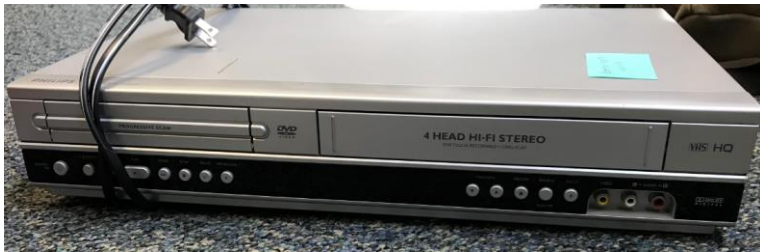
Phillips DVP3340V DVD/VCR – Qty: 1