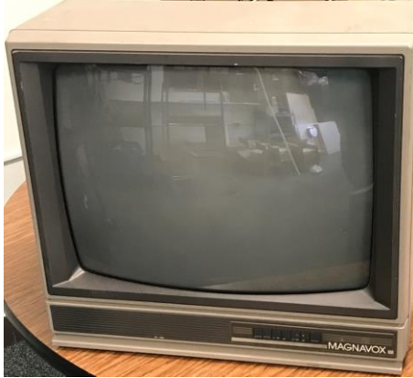
Magnavox RX9019 GY02 Television – Qty: 3