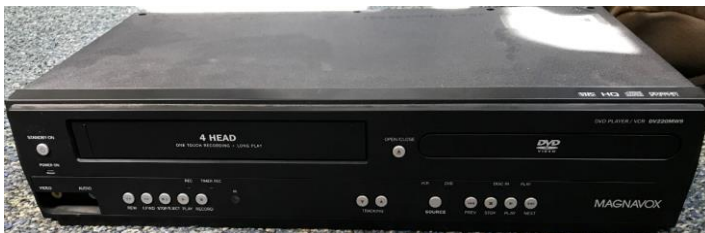
Magnavox DV220MW9 DVD/VCR Player – Qty: 2