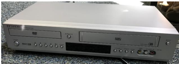
Samsung DVD-V5500 DVD/VCR – Qty: 1

Devices are not guaranteed to function. Operating systems, office programs and other applications are not included. Accessories such as power cords, av cords, adapters, mice, keyboards, etc. not included. Herscher CUSD #2 reserves the right to deny any and all bids.