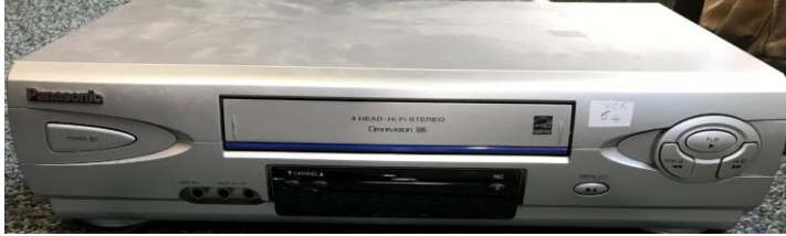
Panasonic PV-V4624S – Qty: 1