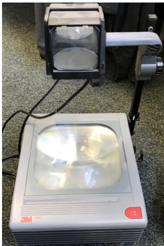
3M 9060 Overhead Projector – Qty: 1