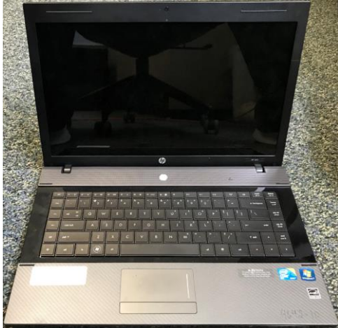
HP 620 Laptop – Qty: 5